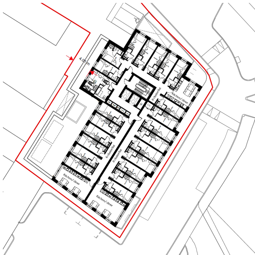
3 rd – 6 th floor plan for the appeal scheme showing the narrowest set back for a window.