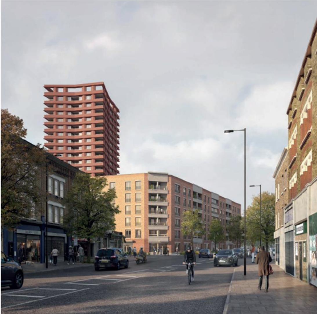
CGI Street view looking north-west from Old Kent Road