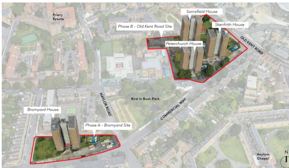
Existing site aerial