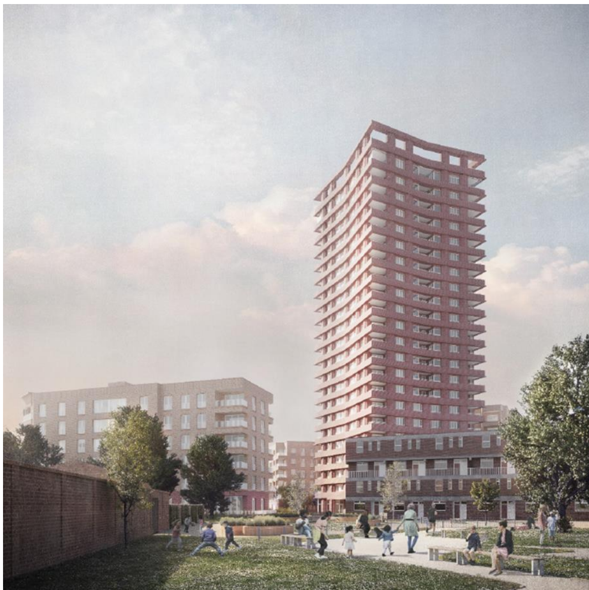
Proposed view of Building B4 from PenCraig Way