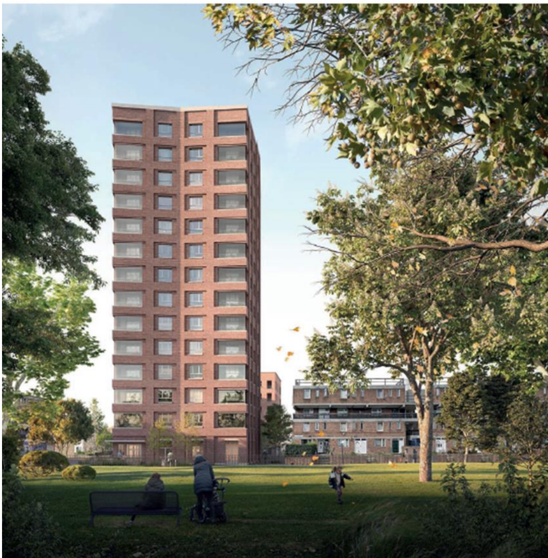
CGI looking west across Bird in Bush park to the Bromyard site