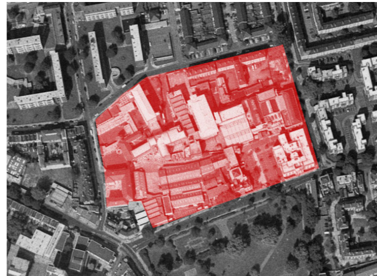
Aerial View of Site C

Key to unlocking the potential of the site is the creation of a high quality ‘public realm’, which is formed by the organisation of the streets and spaces and building form.