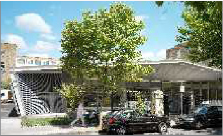
Consultation at the One Stop Shop

Overall, local stakeholders have supported the approach being taken. Details of the feedback provided can be found in Appendix 6.2.