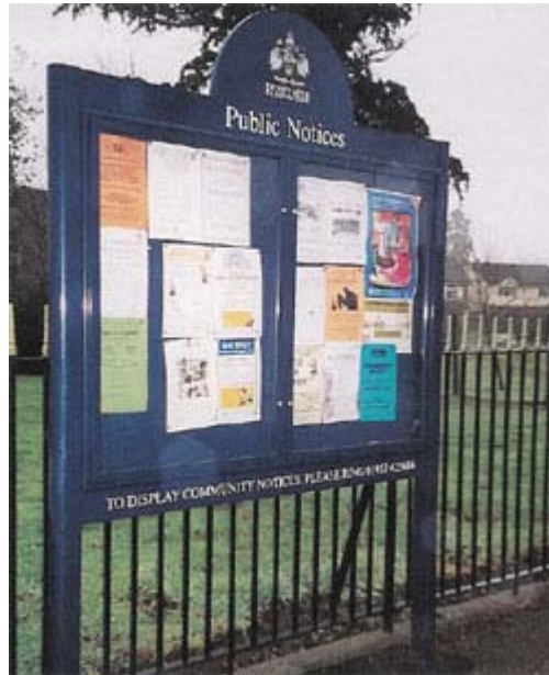
Option 3 £1500 each