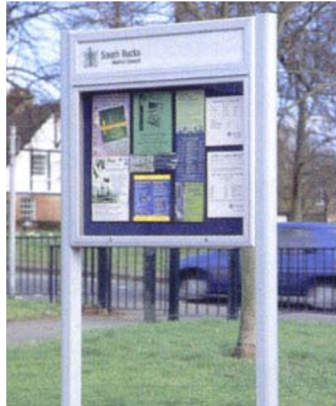
Option 2 £500 each