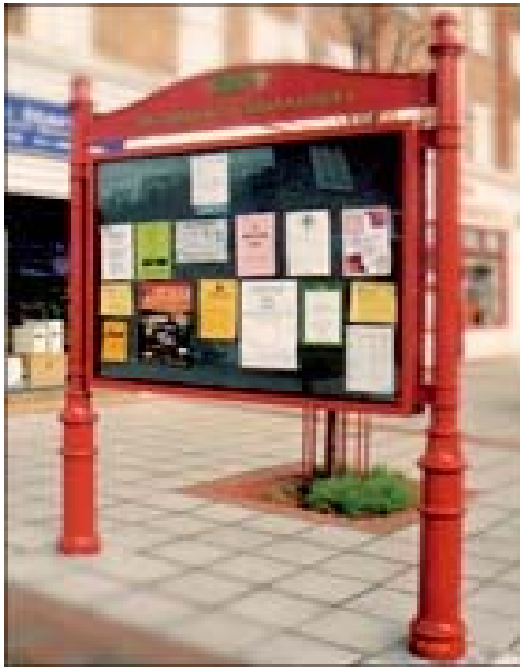
Option 1 £2300 each