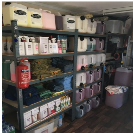
Compliant chemical storage