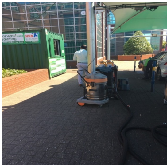
Safe electrical appliances & installations