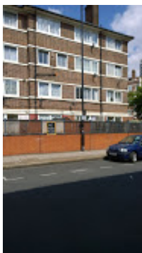
A&H Saturday 21 06 14 photo 3.jpg 239K

The email you received and any files transmitted with it are confidential, may be covered by legal and/or professional privilege and are intended solely for the use of the individual or entity to whom they are addressed. If you have received this in error please notify us immediately. If you are not the intended recipient of the email or the person responsible for delivering it to them you may not copy it, forward it or otherwise use it for any purpose or disclose its contents to any other person. To do so may be unlawful. Where opinions are expressed in the email they are not necessarily those of Southwark Council and Southwark Council is not responsible for any changes made to the message after it has been sent.