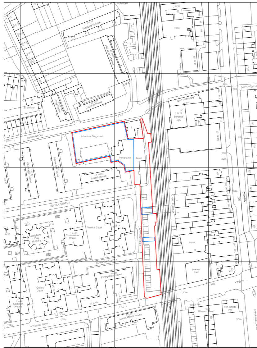
01 Site location plan 1:1250@A0