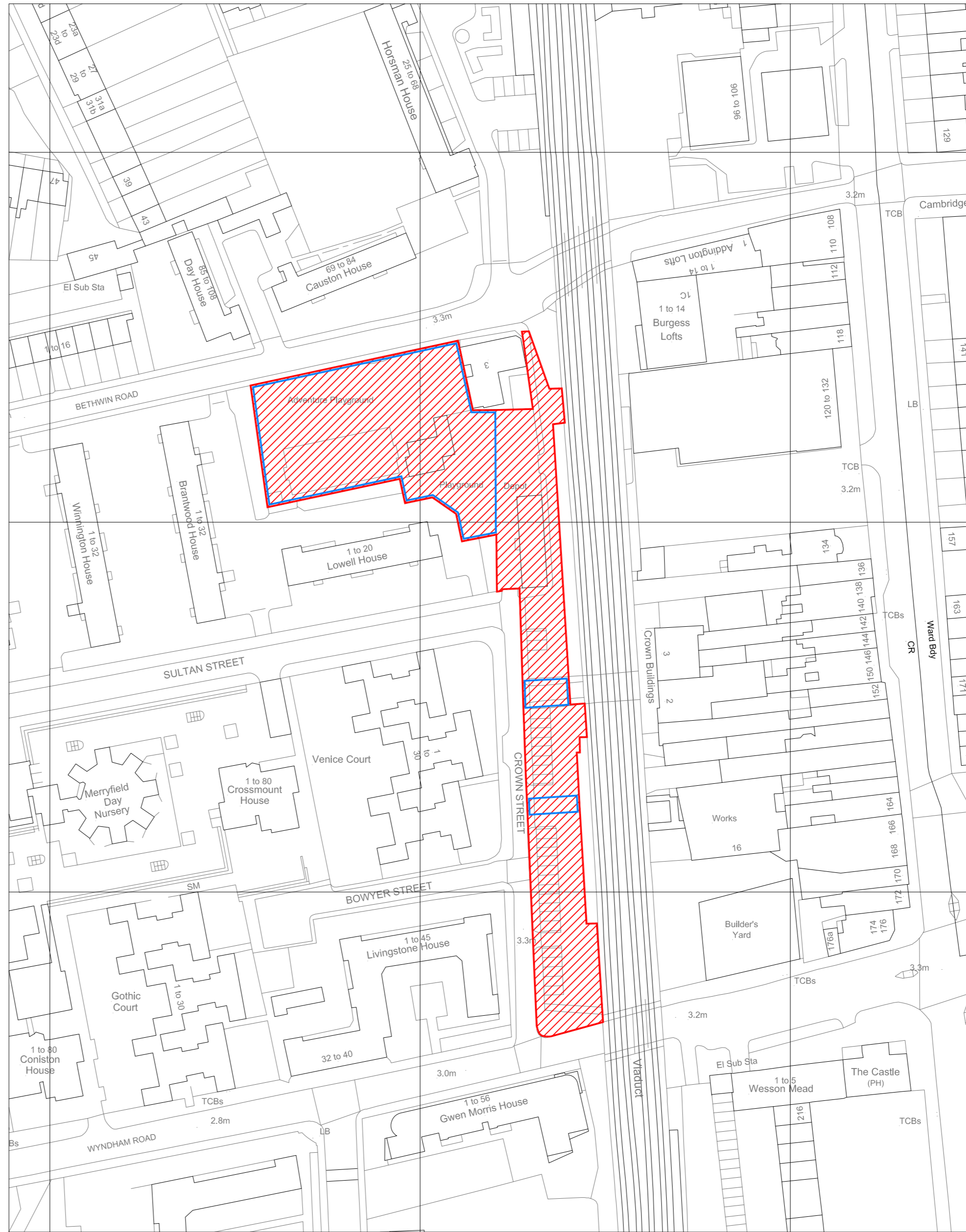
03 Site Location 1:500@A0

GENERAL NOTES: All dimensions are in millimetres unless noted otherwise. All rights reserved. All drawings and written material appearing herein constitute original and unpublished work of the architect.