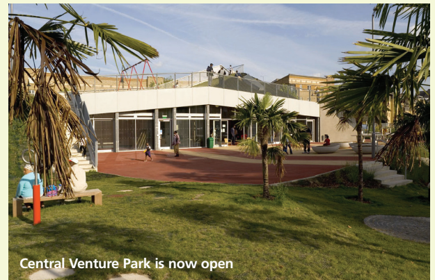
Central Venture Park is now open

For further details contact either Dave Ware on 020 7525 1028 or email dave.ware@southwark.gov.uk or Pauline Bonner on 020 7525 1019 or email pauline.bonner@southwark.gov.uk